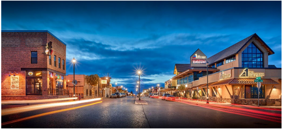
Downtown Watford City

The ND climate is well known for its challenges, but for these two cities is considered to be the garden spot of North Dakota, with a mean January temperature of 17°F and a mean July temperature of 72°F. Seasonal extremes range from 105°F to -25°F, but these are only rare occurrences over the years. The housing market in both communities is strong, much of that a result of the energy market causing an economic boom and increased construction to meet expanding needs in that arena. Homes for sale come in all price ranges. Rentals are more in demand, with a 1-bedroom apartment starting at between $750 and $1,200/month. Forest Service housing may be available in both districts. Both Watford City and Dickinson have excellent Park and Recreation Departments with programs available for kids and adults. Both cities have a variety of entertainment, shopping and business services. Both benefit from new state of the art, multi-million dollar and all-season indoor recreational facilities with full complements of exercise opportunities from swimming and weights to running, volleyball, racquetball, basketball, and tennis. World-class bird and big-game hunting are complemented by hiking, biking, and equestrian trails, one of which is located on the Little Missouri National Grasslands, the 145-mile Maah Daah Hey Trail.