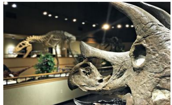
Badlands Dinosaur Museum