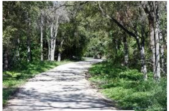
Walking Trail in Dickinson

Dickinson State University is located in Dickinson and Williston City College is a short 45 minutes from Watford City. The cities have 36 churches between the two of them, representing most denominations (10 churches in Watford and 26 in Dickinson). There are several medical clinics in each city with full trauma care hospitals located in Dickinson and in Williston, near Watford City.