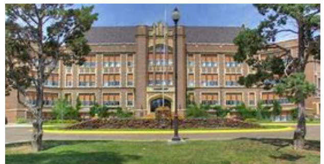
Dickinson State University