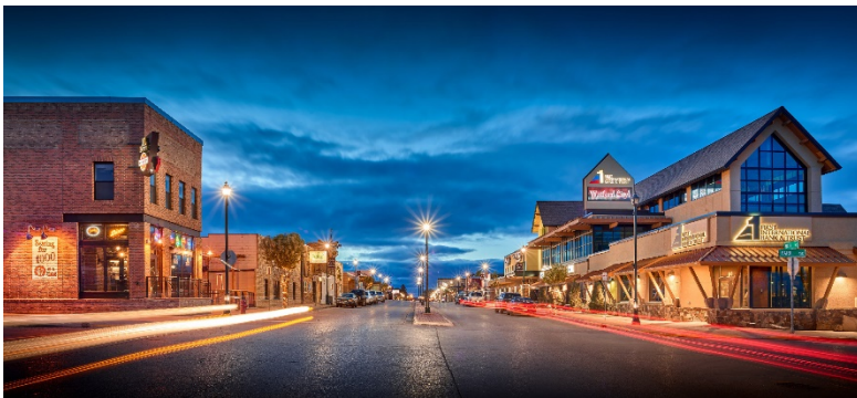
Downtown Watford City

Watford City (pop. 7,800) is a full-service community that serves as the county seat for McKenzie County (pop. 15,000). Services include a hospital, health clinic, dentist, optometrist, recreation center, library, three full service banks and a credit union, hairdressers, grocery stores, a summer farmer's market, drug stores, hardware and lumber yard, mechanics, restaurants, motels, a movie theater, retail stores, 11 churches of various denominations and a municipal airport. Watford hosts a number of annual community events including the McKenzie County Fair and Rodeo, Rib Fest and more.