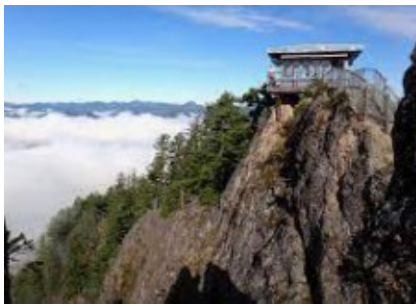
Acker Rock L.O.

The Umpqua National Forest covers nearly one million acres along the western slopes of the Cascade Mountains in Southwest Oregon. The Forest encompasses a diverse area of sparkling rivers and lakes, deep canyons, and rugged mountains up to 9,200 feet in elevation. The Umpqua produces a wealth of water resources, forest, wildlife, fish habitat, minerals, and outdoor recreation opportunities. Visitors discover a diverse place of thundering waters, high mountain lakes, heart-stopping rapids, and peaceful ponds. The Forest is characterized by its many waterfalls, acres of native forest, three wildernesses, and the Oregon Cascades Recreation Area. Also within the Umpqua is the Diamond Lake Recreation Composite, one of the largest developed recreational facilities within the Forest Service. About 75% of the Forest is within the Umpqua Basin, which is also the boundaries of Douglas County. The Forest comprises 25% of Douglas County.