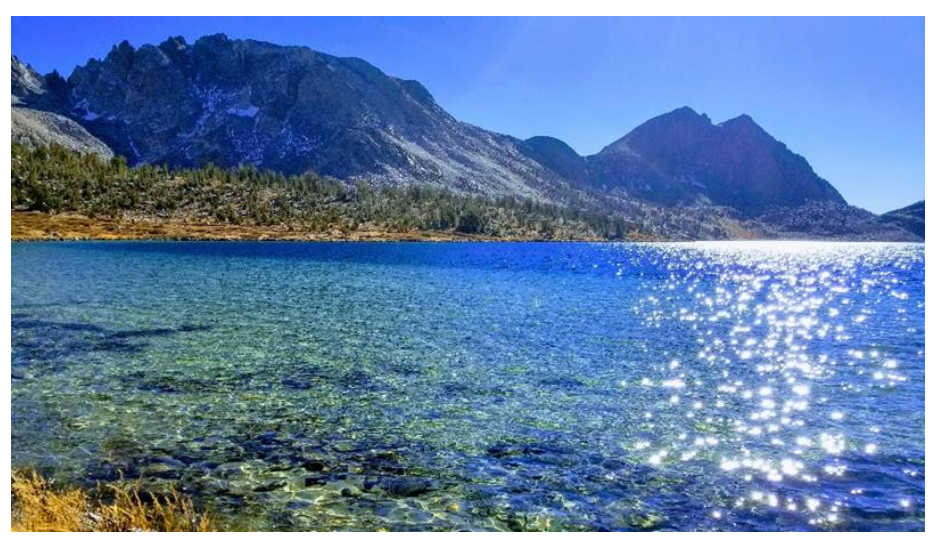
Apply – January 27 through February 5, 2020 by 8:59 p.m. PST