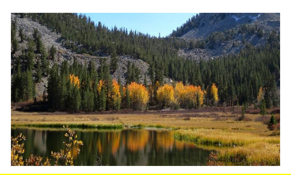
Apply – January 27 through February 5, 2020 by 8:59 p.m. PST

www.bishopvisitor.com/ www.inyocounty.us/ www.ci.mammoth-lakes.ca.us