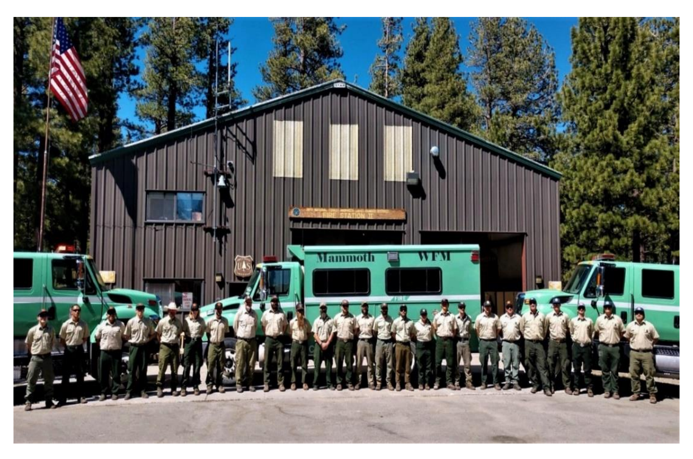
Apply – January 27 through February 5, 2020 by 8:59 p.m. PST