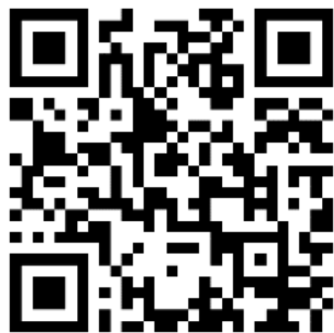
Summer 2023 Eastern Oregon USFS Interest Survey

In order to discuss your interests with a supervisor, please respond to this outreach. Your response is important. Please submit the electronic survey below or email your outreach response to the supervisor listed for each location (pg 8-14).