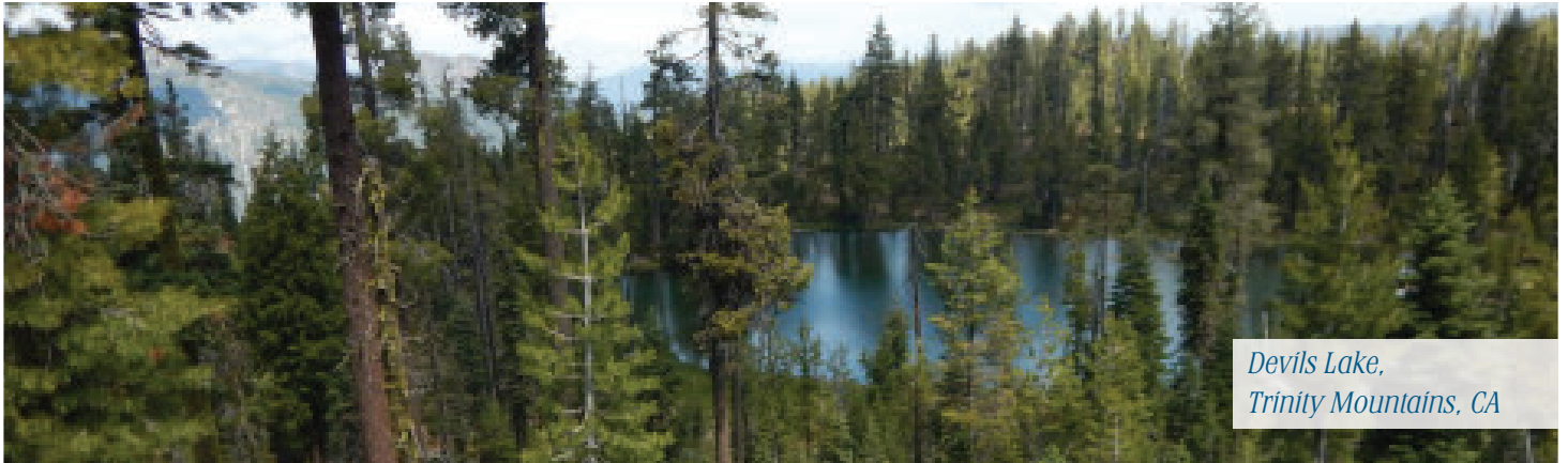
Devils Lake, Trinity Mountains, CA

These positions will require overnight travel and work outside of the base location. Meals/lodging will be provided by SPI when assigned to work from a location other than the base location. Employees must find their own housing within the base location during their employment.