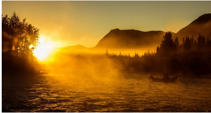
The confluence of the Kenai and Russian Rivers.

Thank you for your interest in our position!